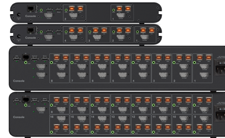
Rear of Universal 2nd Generation SKVMs