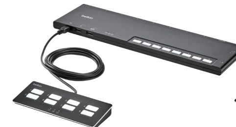
8-Port Single-Head Modular SKVM Switch Base Unit PP4.0 w/Remote FIDN108MOD-BA-4