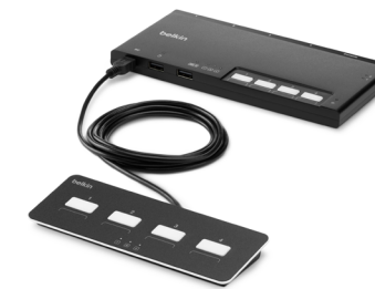
4-Port Single-Head Modular SKVM Switch Base Unit PP4.0 w/Remote FIDN104MOD-BA-4