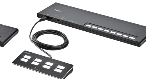
8-Port Dual-Head Modular SKVM Switch Base Unit PP4.0 w/Remote FIDN208MOD-BA-4