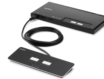
2-Port Single-Head Modular SKVM Switch Base Unit PP4.0 w/Remote FIDN102MOD-BA-4