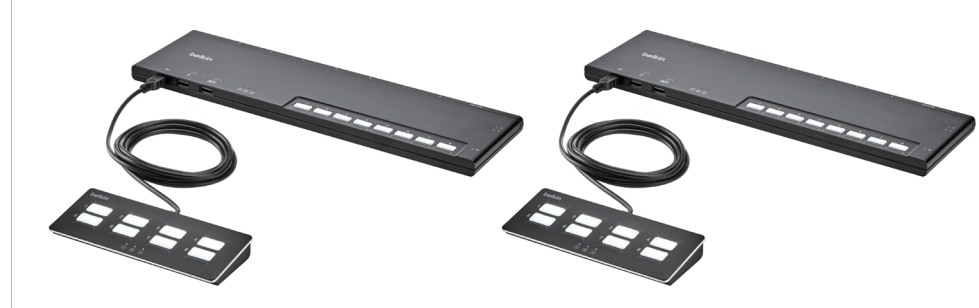
8-Port Single-Head Modular SKVM Switch Base Unit PP4.0 w/Remote FIDN108MOD-BA-4