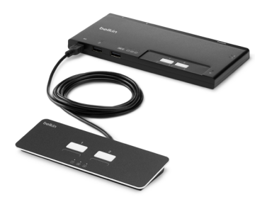
2-Port Single-Head Modular SKVM Switch Base Unit PP4.0 w/Remote FIDN102MOD-BA-4