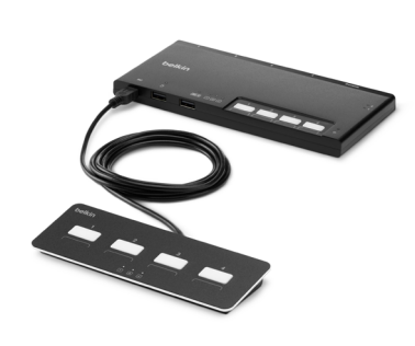
4-Port Dual-Head Modular SKVM Switch Base Unit PP4.0 w/Remote FIDN204MOD-BA-4