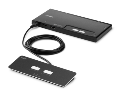
2-Port Dual-Head Modular SKVM Switch Base Unit PP4.0 w/Remote FIDN202MOD-BA-4