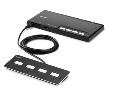
4-Port Single-Head Modular SKVM Switch Base Unit PP4.0 w/Remote FIDN104MOD-BA-4