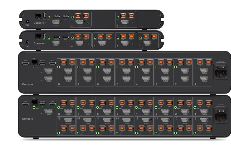
Rear of Universal 2nd Generation SKVMs