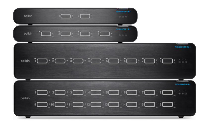
Front of Universal 2nd Generation SKVMs