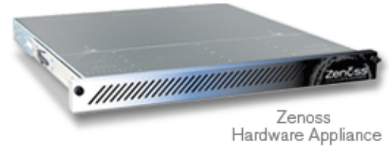
Zenoss Hardware Appliance

Zenoss Appliance is a hardware box complete with a certified build of Zenoss Enterprise Edition and Linux Operating System. It is available in 2 different sizes to fit your IT needs. Zenoss Appliance 250 is ideal for smaller deployments and can be used to monitor up to 250 resources. Zenoss Appliance 1000 is typically used in larger deployments and can scale to monitor thousands of resources. Both hardware appliances are ideal for companies looking to deploy an enterprise IT management solution with minimum IT effort and substantial time savings. Zenoss Hardware Appliance is only available with an Enterprise Subscription, and is automatically maintained and updated with Zenoss Update Service.