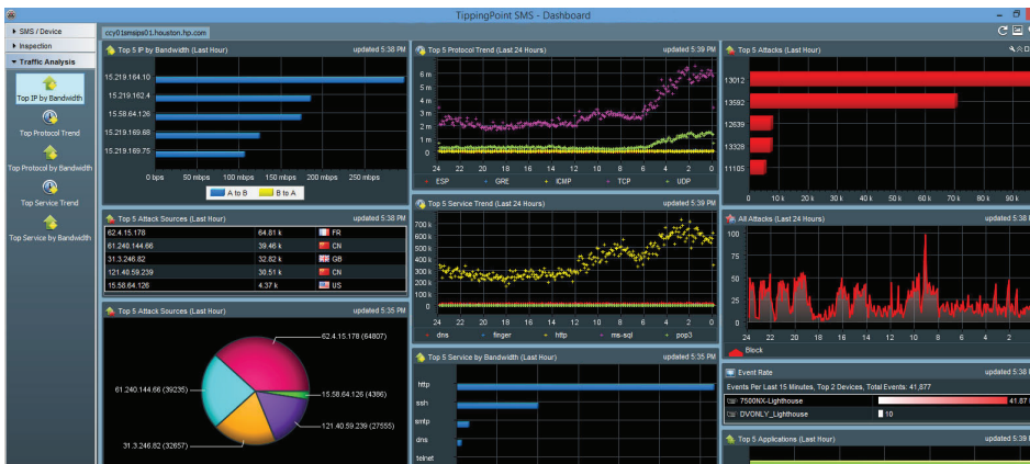
TippingPoint Security Management System Dashboard

A significant component of TippingPoint SMS is the dashboard. It provides at-a-glance monitoring and launch capabilities into targeted management applications, and an overview of current performance for all TippingPoint devices in the network, including notifications of updates and potential issues that may need attention. Customers are also able to customize the SMS dashboard to their specific needs using a dashboard palette of drag-and-drop configurable gadgets that are categorized by health and status, task status, inspection event, event rate, security, reputation, application, and user.