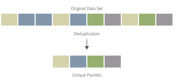
Figure 1: Packet Deduplication.

The NETSCOUT deduplication capability removes packet duplicates and provides a substantial reduction in the volume of traffic to the tools. This provides an increase in tool efficiency, a reduction in errors on the monitoring tool, and a closure of security holes that exist in other implementations.