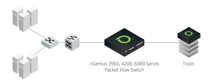
Figure 2: Integrated Hardware & Software with Packet Flow Switch.