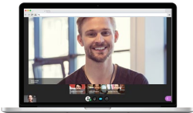
Follow the Speaker HD Video Conferencing

Blackboard Collaborate delivers a wide spectrum of collaboration features and functionality that support individual needs and learning styles to maximize learner engagement. It is helping thousands of professional, corporate, and government organizations worldwide deliver a more effective learning experience through online, blended, and mobile learning.