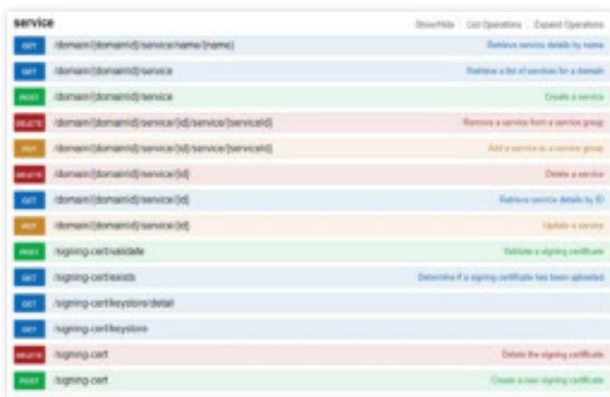
Figure 2. Example List of API Operations