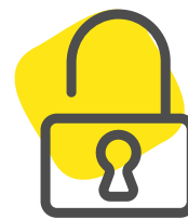
Edge Security Pack

Kemp LoadMaster is Government Cloud enabled with models listed in the Azure Government Marketplace, the AWS GovCloud Marketplace, and utilized by FEDRAMP certified solution providers, empowering cloud and hybrid cloud for government agencies.