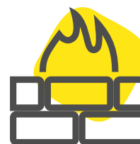
Web Application Firewall